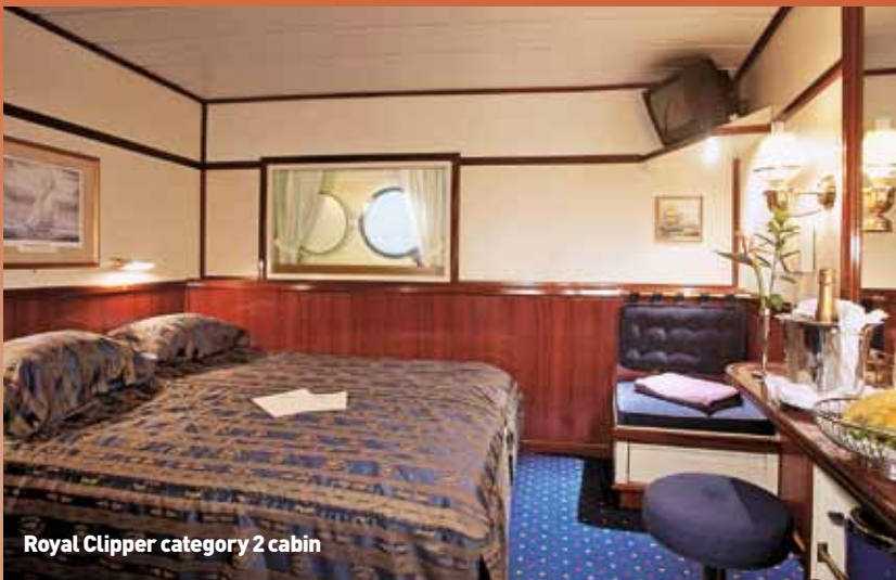
Royal Clipper category 2 cabin