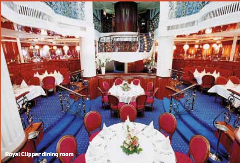
Royal Clipper dining room